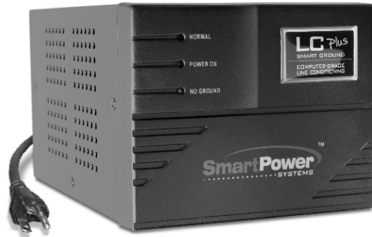
COMPUTER-GRADE LINE CONDITIONING

User's guide for the following models: LC70SG-2R, LC100SG-2R, LC180SG-4R, LC200SG-4R, LC300SG-4R